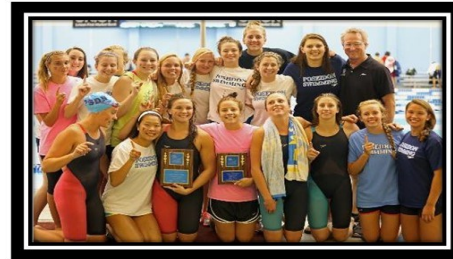
1 st Place Women's Team 2014 LCM Senior Championships